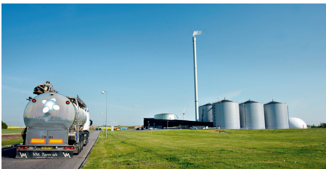
Figure 1: General view of Maabjerg BioEnergy Plant, (Photo: Maabjerg BioEnergy)

The biogas plant was born as an environmental project aiming to reduce runoff of nutrients into groundwater, rivers and bays, while contributing to develop the local farming economy and preserving employment. The aim was furthermore to support environmentally friendly energy production by exploiting biomass resources for the benefit of the local community. Farmers, represented by the Holstebro-Struer Farmers Association and the Holstebro Fur Breeders Association, in collaboration with the neighbouring utility companies Vestforsyning and Struer Forsyning, joined forces to establish Maabjerg BioEnergy. Maabjerg BioEnergy which is a key part of the future concept of creating a biorefinery centered around production of 2 nd generation bioethanol from straw.