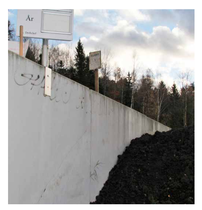
Figure 2: Sewage sludge collected between September 2012 and August 2013 from a specific location in Sweden.

One of the main drivers behind the creation of REVAQ is to increase the recirculation of nutrients in our society. Special attention is given to the limited resource phosphorous, but also nitrogen, micronutrients and organic matter which are