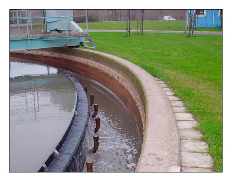
Figure 5: It is important to remove non-biodegradable contaminants at the source, so they don't end up in the wastewater. At the wastewater treatment plant these contaminants are very hard to remove.

The REVAQ certification system has shown that it is possible to simultaneously build confidence, reduce contaminants and increase the recycling of nutrients and organic matter by implementing a systematic, transparent and goaloriented cooperation between key stakeholders.