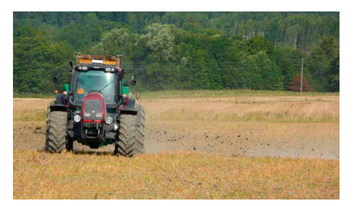
Figure 3: REVAQ certified digestate being spread onto agricultural land in Sweden.

Figure 4 illustrates the progress of the work to remove cadmium from the digestate, by showing the distribution of cadmium levels in the digestate of the certified WWTPs in