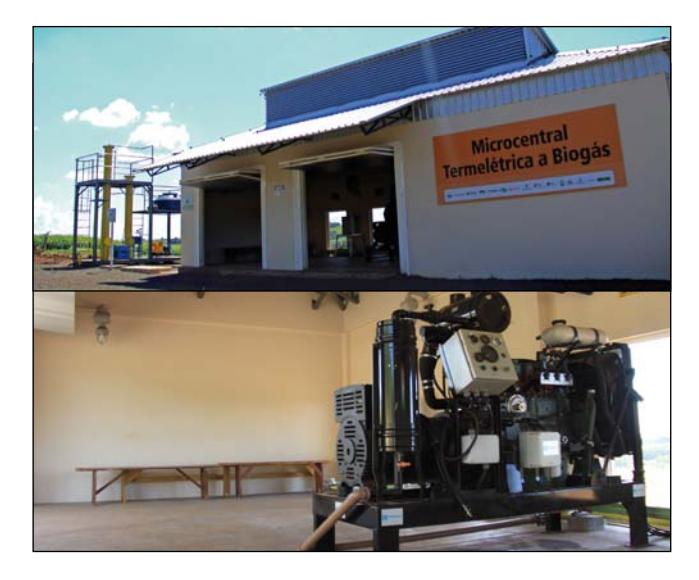
Figure 4: The centralised combined heat and power (CHP) plant supplied by biogas through the biogas pipeline