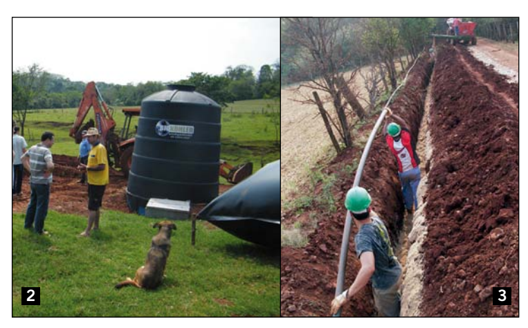
Figure 2: A anaerobic digesters for biogas production during installation on small farms included in the project

Figure 3: Laying of part of the 22-km biogas pipeline