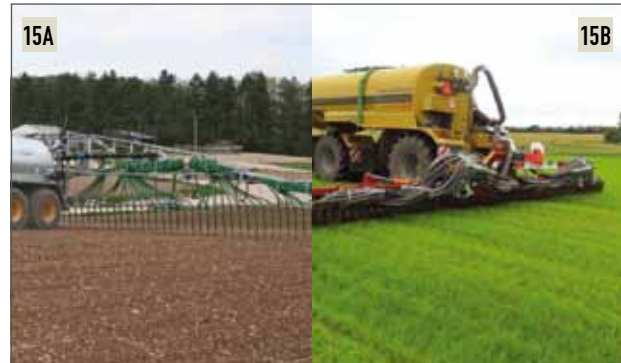
Figure 15: Digestate is applied as fertilizer with the same equipment which is normally used for application of liquid manure and slurry. 15A: Band application of digestate on freshly cultivated soil; Source: Collyer Services Ltd, ( http://www.ihampshire.co.uk/profile/10449/Waterlooville/Collyers-Services-Ltd/ ); 15B Injection of digestate into the top soil, for minimization of nitrogen losses through ammonia volatilization. Source: Rækkeborg Maskinstation ( www.raekkeborgmaskinstation.dk ).