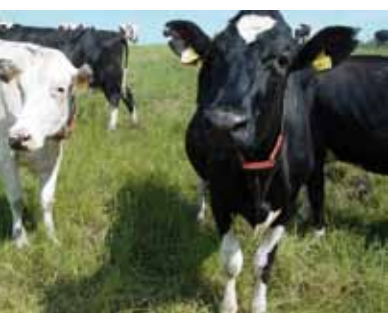
Figure 1: Ruminants, landfills, volcanic hot springs and rice fields are all active methane producers.

Use of digestate as fertiliser requires that rigorous attention is paid to the quality of digestate and the feedstock supplied to biogas plants where digestate is intended for use as fertiliser. This is the only way to achieve maximum ecological and economic benefits, while at the same time ensuring sustainability and environmental safety. Quality management of digestate used as fertiliser should be integrated into overall national environmental protection and nutrient management policies. Good examples of this can be found in countries like Austria, Canada (Ontario), Denmark, Germany, Netherlands, Sweden, Switzerland and the United Kingdom. National regulatory frameworks for digestate quality management and certification for use enhance its use as fertiliser in a safe and sustainable way.