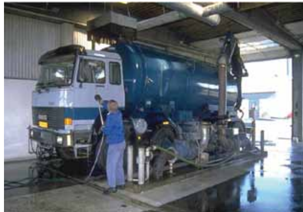
Figure 9: Exterior disinfection of slurry transport vehicle.