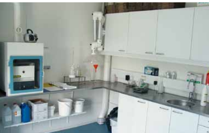
Figure 10: Mini laboratory at Lemvig Biogas Plant in Denmark

Biogas plants in Denmark, particularly large scale centralised plants, include small laboratories on site for measuring the dry matter content, the organic dry matter and the pH of samples from all loads of digestate (Figure 10). More complex nutrient content analyses are carried out by accredited laboratories. To avoid any uncertainty, the frequency and the procedure for sampling and analysis should be stipulated by specific protocols.