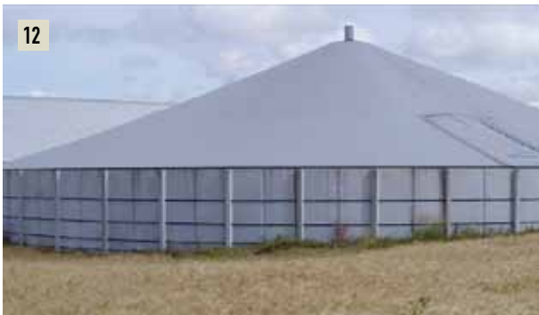
Figure 12: Digestate storage tank, covered with gas tight membrane (soft cover) fastened on the edges of the tank.