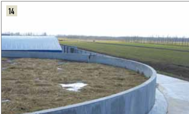
Figure 14: Open storage tank for digestate with freshly chopped straw spread on the liquid surface.