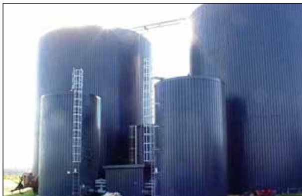
Figure 8: Pasteurisation tanks in foreground, at Blaabjerg AD plant in Denmark.

spongiform encephalopathy (BSE) and of foot and mouth disease (mononucleosis) have led to the enforcement of strict rules on treatment and further use of animal by-products, in order to prevent transmission of these diseases. The ABP regulation stipulates, inter alia , which categories of animal by-products and in which conditions they are allowed to be treated in biogas plants. For specific animal by-products the ABP Regulation requires batch sanitation by pressure sterilisation or by pasteurisation at 70°C for 1 hour (Figure 8), and also sets limits for particle size and count for indicator organisms such as Escherichia coli , Enterococcaceae and Salmonella . More information is available at www.iea-biogas.net and in Appendix 4 of this brochure.