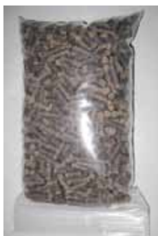
Figure 11: Fertilizer pellets produced from decanter separated fibre fraction, through application of the patented VALPURENTM-process at the AD plant in Spain.

Complete processing applies different methods and technologies, each at different stages of technical maturity (Braun et al. 2010). Membrane technologies such as nano- and ultra-filtration, followed by reverse osmosis are used for nutrient recovery (Fakhru'l-Razi 1994, Diltz et al. 2007). Membrane filtration gives two products, a nutrient concentrate and purified process water (Castelblanque and Salimbeni 1999, Klink et al. 2007). The liquid digestate can alternatively be purified by aerobic biological wastewater treatment (Camarero et al. 1996). Addition of an external carbon source may be necessary to achieve appropriate denitrification because of the high nitrogen content and low biological oxygen demand (BOD). A further possibility for concentrating digestate is evaporation using surplus heat from the biogas plant. Stripping (Siegrist et al. 2005), ion exchange (Sánchez et al. 1995) and struvite precipitation (Uludag-Demirer et al. 2005, Marti et al. 2008) can be used to reduce the nitrogen content in the digestate. Independent of the technologies used, complete processing requires high chemical and energy inputs. Treatment costs are usually high and there will be higher investment costs for appropriate machinery.