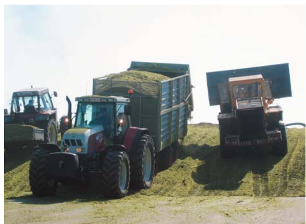
Fig. 3: 11,000 t of energy crops are harvested per year and stored and ensiled in 4 bunker silos

The used energy crops are metered into the main fermenter using a special designed hopper. The hopper was designed and assembled by the general contractor Thöni Energietechnik and can store a two days stock of substrate. Due to its exact metering system, including a full automatic balance, the energy crops can be brought in continuously (every 30 minutes). An automatic conveyer system and a spiral discharge the crops below the liquid surface. By this means approximately 25 t/d or 11.000 t/a solid substrates are fed in the main digester (Tab. 1).