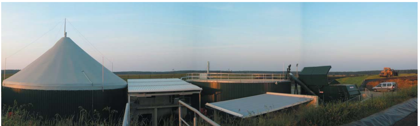
Fig.1: The Strem Biogas plant in the Guessing Region (Burgenland, Austria). From right to left the final storage lagoon, the bunker silo in the background, the substrate hopper, the first and the second digester

The Energy Crop Digestion Plant in Strem, Austria (Fig. 1), is a further milestone in the eco-energy initiative of the Guessing region in the South-Eastern part of Austria, district Burgenland. Strem was the first Austrian Biogas plant based solely on solid energy crop substrates. The produced biogas is converted into power and heat and the energy is sold to the public power grid and the local district heating network.