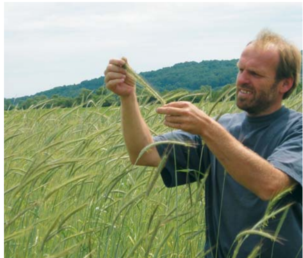
Fig. 2: The plant operator, monitoring the quality of regional growing rye-grass

In the Güssing region, the expansion of the European Union has resulted in major structural changes within the agricultural sector. Many agricultural enterprises converted from full acquisition to supplementary income, resulted in grassland and acres that was not cultivated any longer and fell into fallow land. Thus sufficient agricultural land for energy crop production was available in the closest periphery of the biogas plant. The plants – grass, clover, maize and sunflowers – can be produced by environmentally careful agricultural management with a minimum transportation required. The Austrian renewable-energy granting scheme gave the opportunity to sell the produced biogas as converted electricity into the power grid. For the 500 kWel biogas plant, an energy supply price of 14,5 cent/kWh is guaranteed for 13 years.